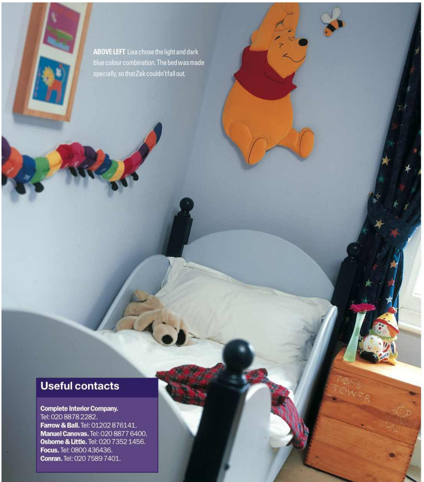
ABOVE LEFT Lisa chose the light and dark blue colour combination. The bed was made specially, so that Zak couldn't fall out.